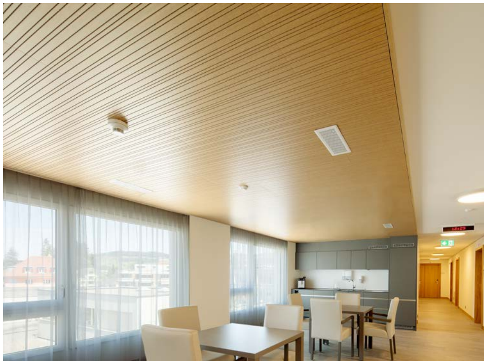
Bernstrasse, Thun . Photo: Isabelle Hadorn, Zöllikofen

Topakustik AG | Obseestrasse 11 | 6078 Lungern | Schweiz T +41 41 679 73 73 | contact@topakustik.ch | www.topakustik.ch CHE-101.964.094 MwSt